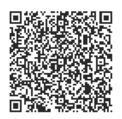
Scan to order! ¡Echa un vistazo para encargar!

Thursday, September 21, 2023 South Charlotte Middle School